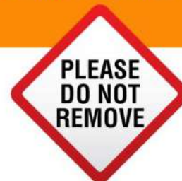
FIGURE 2—WARNING LABEL